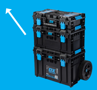
OX TOOLTREK STORAGE SYSTEM - 3 PIECE

0X-P600703 COMPRISED OF 0X-P602115, 0X-P602225 AND 0X-P602601