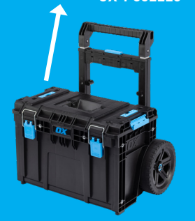
OX TOOLTREK CART BASE UNIT OX-P602601