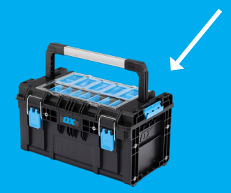
OX TOOLTREK PRO TOTE TOOL BOX WITH ORGANISER TOP OX-P602001

0X-P600703 COMPRISED OF 0X-P602115, 0X-P602225 AND 0X-P602601